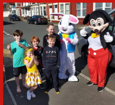
• Easter Bunny and Mickey Mouse presented Easter eggs to every adult and child.

Thank you also to everyone who came along, we hope you enjoyed it as much as we did.