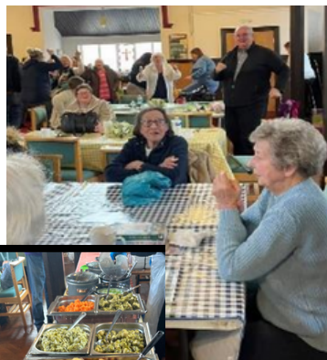
• The roast lunches are very popular.

"We are very grateful for your support."